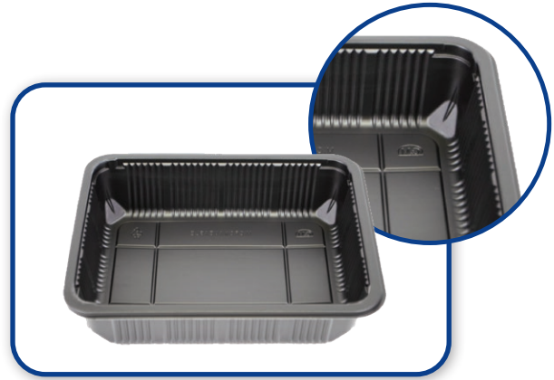
NOT FILM COATED