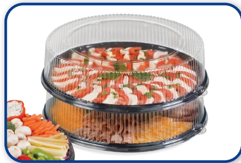
CLEAR PET DOMES