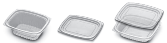
Separate pieces and combo packs

It's plain to see why D&W VersaPak® containers demand attention. Clear, smooth-ribbed sidewalls showcase product and stack up nicely for shelf display, transport or creative merchandising. A variety of style and size options are designed for every food application and customer convenience.